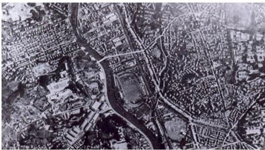
Nagasaki, before and after

When Harry Truman took over the presidency, he learned of the top-secret Manhattan Project , charged with developing the atomic bomb. It cost more than $2 billion and employed 120,000 people. Truman ordered the dropping of atomic bombs on the Japanese cities of Hiroshima , on August 6, and Nagasaki , on August 9. At the time, the belief that Japan’s military leaders would never surrender unless their country was utterly devastated convinced policymakers that they had to deploy the atomic bomb. One hundred thousand people died at Hiroshima and sixty thousand at Nagasaki; tens of thousands more died slowly of radiation poisoning. Japan offered to surrender on August 10 and signed a formal treaty of surrender on September 2, 1945.