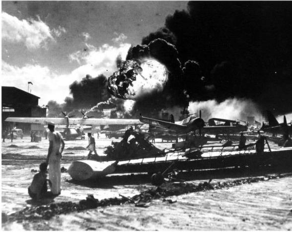
Pearl Harbor, December 7 1941

and embargoes on aviation fuel and scrap metal. When Japanese troops occupied the rest of Indochina, Roosevelt froze Japanese assets in the United States and instituted an embargo on trade with Japan, including oil shipments.