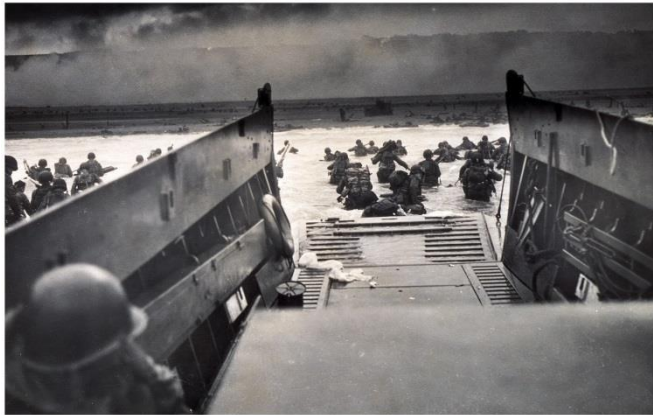
Hitting the Beach at Normandy

in the Battle of the Bulge, the final German offensive. As American, British, and Soviet troops advanced toward Berlin, Hitler committed suicide in his bunker on April 30; Germany surrendered on May 8, 1945.