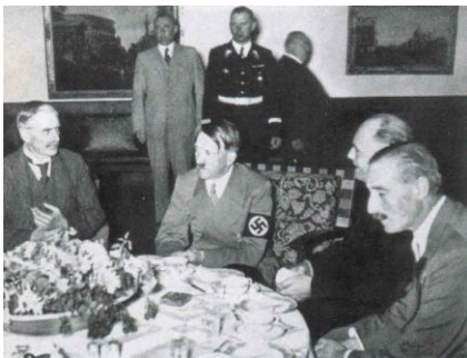
European leaders, including British Prime Minister Neville Chamberlain (left), and German dictator, Adolf Hitler (center) at the Munich Conference in 1938

The Neutrality Act imposed an embargo on arms trading with countries at war and declared that American citizens traveled on the ships of belligerent nations at their own risk; in 1936, the Neutrality Act was expanded to ban loans to belligerents, and in 1937, it adopted a “cash-and-carry” provision.