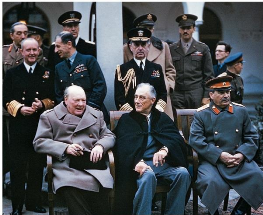
The Big 3 – Churchill, FDR, and Stalin

The Allied coalition was composed mainly of Great Britain, the United States, and the Soviet Union, and its leaders (Winston Churchill, Roosevelt, and Joseph Stalin) set overall strategy. Churchill and Roosevelt's Atlantic Charter formed the basis of the Allies' vision of the postwar international order, but Stalin had not been part of that agreement, a fact that would later cause disagreements over its goals. The Russians argued for opening a second front in Europe—preferably in France—because it would draw German troops away from Russian soil.