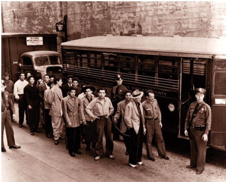
Zoot Suit youth in Los Angeles

The war affected where people lived; families followed service members to training bases or points of debarkation, and the lure of high-paying defense jobs encouraged others to move. As a center of defense production, California was affected by the wartime migration more than any other state, experiencing a 53-percent growth in population. As more than a million African Americans migrated to defense centers in California, Illinois, Michigan, Ohio, and Pennsylvania, racial conflicts arose over jobs and housing.