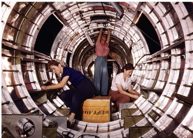
Rosie the Riveter

Government and corporate recruiters sought to remedy the war-induced labor shortage and drew on patriotism to urge women into the workforce. Women made up 36 percent of the labor force in 1945, compared with 24 percent at the beginning of the war, though they faced much discrimination, sexual harassment, and inequitable pay. Women’s participation in the labor force dropped temporarily when the war ended, but it rebounded steadily for the rest of the 1940s.