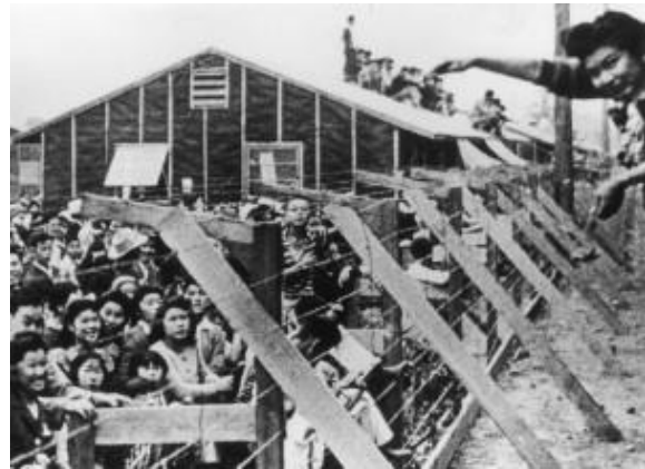
Japanese Relocation Camps

Furloughs for seasonal workers, attendance at a college, and enlistment in the armed services were some routes out of the internment camps. Nisei Gordon Hirabayashi was among the few Japanese Americans who actively resisted incarceration. A student at the University of Washington, Hirabayashi was a religious pacifist who had registered with his draft board as a conscientious objector. He challenged internment by refusing to register for evacuation; instead, he turned himself in to the FBI. Tried and convicted in 1942, he appealed his case to the Supreme Court in Hirabayashi v. United States (1943). In that case, and also in Korematsu v. United States (1944), the Court allowed the removal of Japanese Americans from the West Coast on the basis of “military necessity” but avoided ruling on the constitutionality of the internment program. Congress issued a public apology in 1988 and awarded $20,000 to each of the 80,000 surviving Japanese American internees.