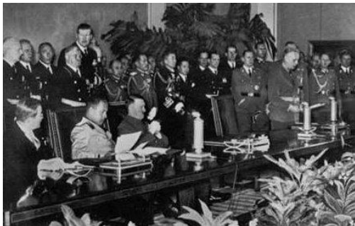
Leaders of Germany, Italy, and Japan sign a defensive pact, the Tripartite Treaty, September 1940

The nation's neutrality was challenged by the aggressive actions of Germany, Italy, and Japan, all determined to expand their borders and their influence. In 1931, Japan occupied Manchuria; then in 1937, it launched a full-scale invasion of China. In 1935, Italy invaded Ethiopia, and by 1936, the Italian subjugation of Ethiopia was complete. The League of Nations condemned the aggression, but it could not stop Italy.