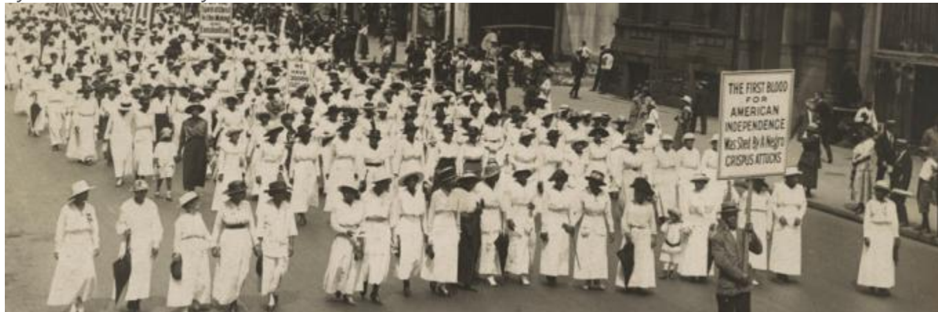
The silent protest parade in New York City against the East St. Louis riots, 1917.

In September 1895, Booker T. Washington, the head of the Tuskegee Institute in Alabama, stepped to the podium at the Atlanta Cotton States Exposition and implored white employers to “cast down your bucket where you are” and hire African Americans who had proven their loyalty even throughout the South’s darkest hours. In return, Washington declared, southerners would be able to enjoy the fruits of a docile work force that would not agitate for full civil rights. Instead, blacks would be “In all things that are purely social . . . as separate as the fingers.”