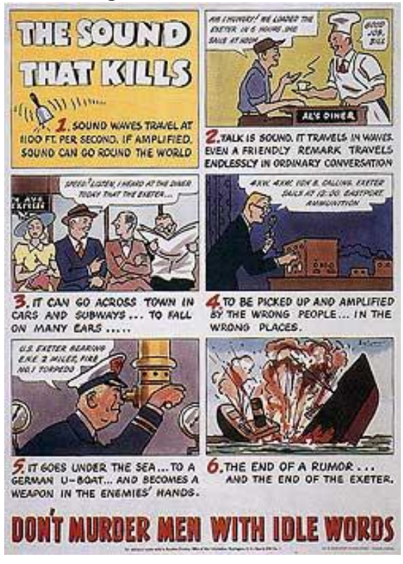
1942 Office of War Information poster warning against the careless leaking of sensitive information.

However, officials also expressed a growing uneasiness with the large number of posters emerging from non-governmental sources and the resulting lack of control over content and distribution. As