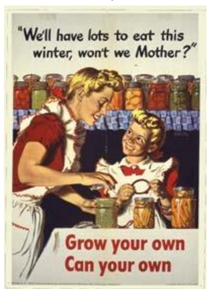
US Office of War Information