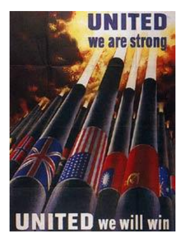
1943, Office of War Information

to create an atmosphere of unity and urgency. Posters called upon workers to conserve, keep their breaks short, and follow their supervisors' instructions. The main thrust was to convince workers, many of whom participated in the violent labor conflicts of the 1930s, that they were no longer just employees of GM or US Steel, but rather they were Uncle Sam's "production soldiers" on the industrial front line of the war.[8]