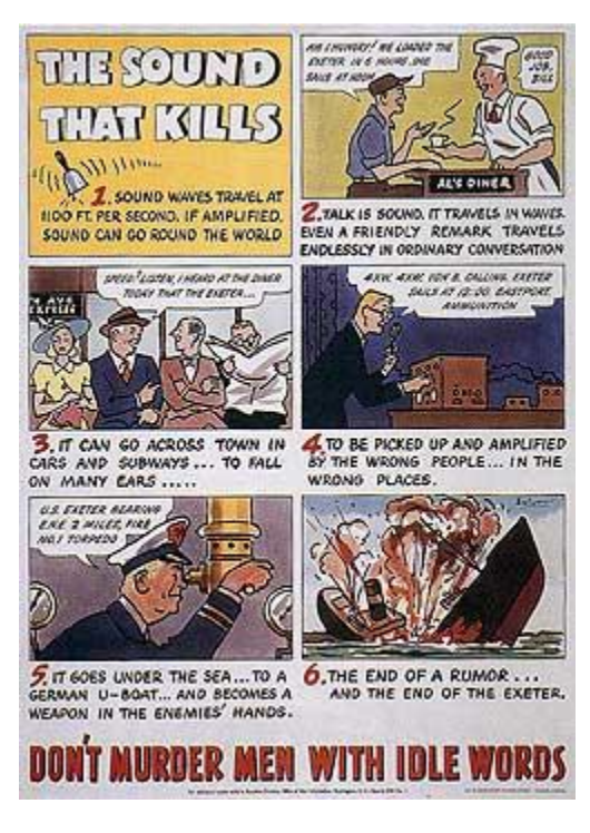
1942 Office of War Information poster warning against the careless leaking of sensitive information.

However, officials also expressed a growing uneasiness with the large number of posters emerging from non-governmental sources and the resulting lack of control over content and distribution. As one government official privately explained, "You just can't let all the painters in the country paint their heads off and make a lot of posters and then slap them up somewhere." [3] After Japan's December 7, 1941 attack on Pearl Harbor, complaints about government poster design intensified.