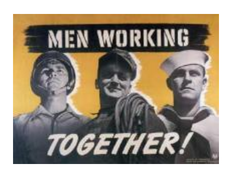
1941, US Office for Emergency Management, Division of Information

Posters castigated workers for punching in late, taking long breaks, damaging the company's equipment, and even drinking after work. Artists turned what had been considered common infractions against a company into acts of betrayal, murder, and disloyalty against the nation.