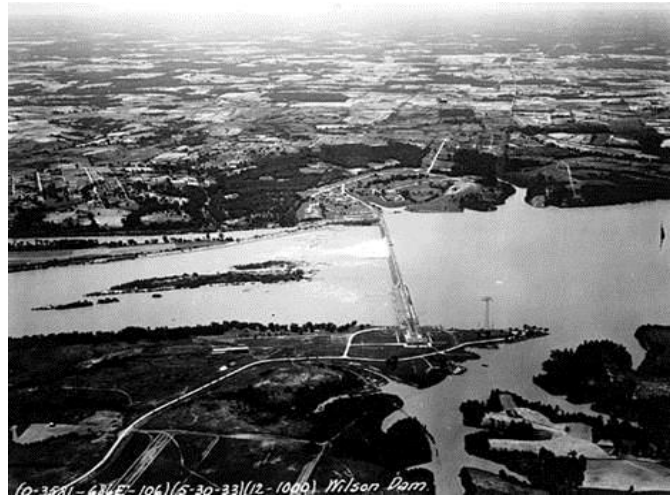
Wilson Dam Location : Alabama May 30, 1933: TVA

AUTHORITY (Reform) Perhaps the most ambitious undertaking of the New Deal, the TVA was a comprehensive federal agency created in 1933 for the economic development of the Tennessee Riverwatershed. The TVA built twenty dams to control flooding, generate hydroelectrical power, increase agricultural production, and revitalize the Tennessee Valley region. The TVA also provided jobs, low-cost housing, reforestation and other services.