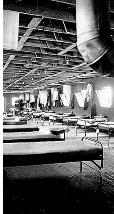
CCC Barracks, Camp Euclid, Ohio September 1936

The FSA was created in 1937 (formerly called the Resettlement Administration in 1935) to aid sharecroppers. The FSA set up temporary housing for "Okies" and "Arkies" (Dust Bowl refugees from Oklahoma and Arkansas) who migrated to California in hope of finding work.